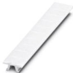
Zack marker strip, 10-section, horizontally labeled with the consecutive numbers: 31 ... 40, white, width: 6 mm

Please be informed that the data shown in this PDF Document is generated from our Online Catalog. Please find the complete data in the user's documentation. Our General Terms of Use for Downloads are valid ( http://phoenixcontact.com/download )